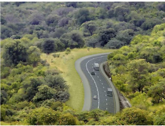
Artist's impression of the new road