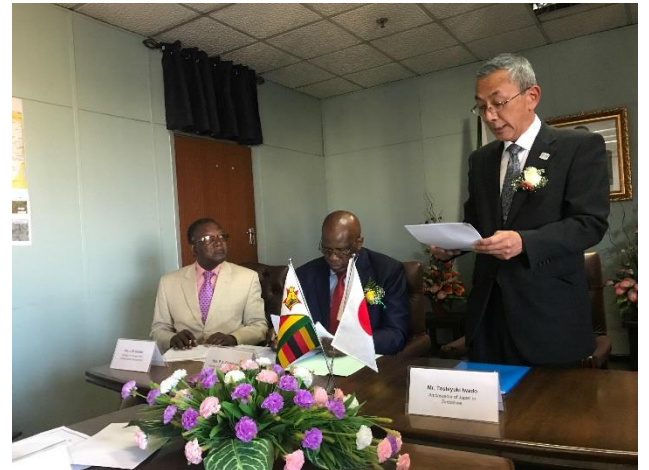
Ambassador Iwado says that the road will improve connectivity