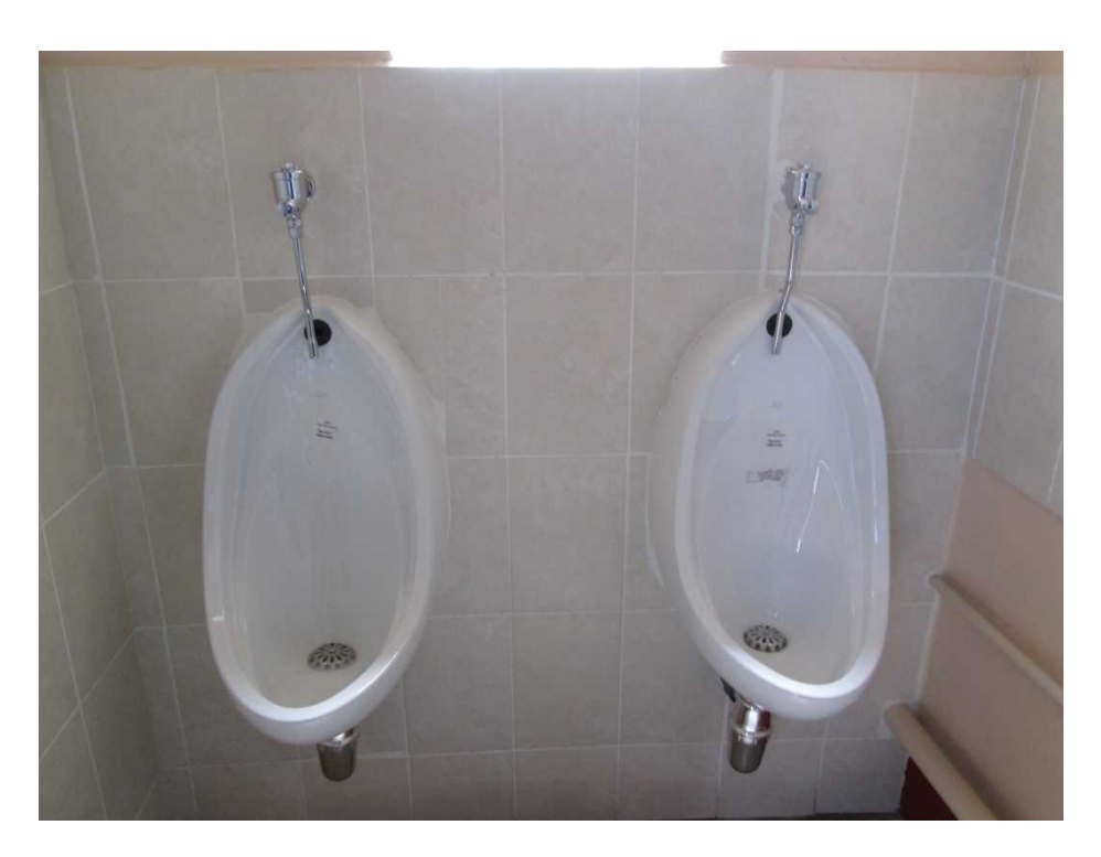
New toilet block