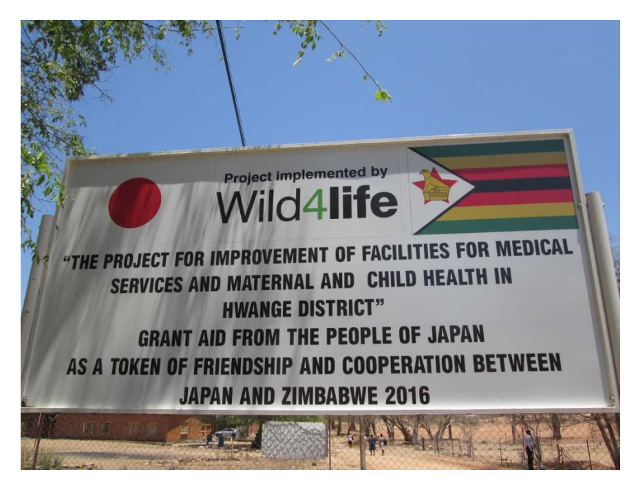
Sign Post outside the Hospital depicting the support by Japan