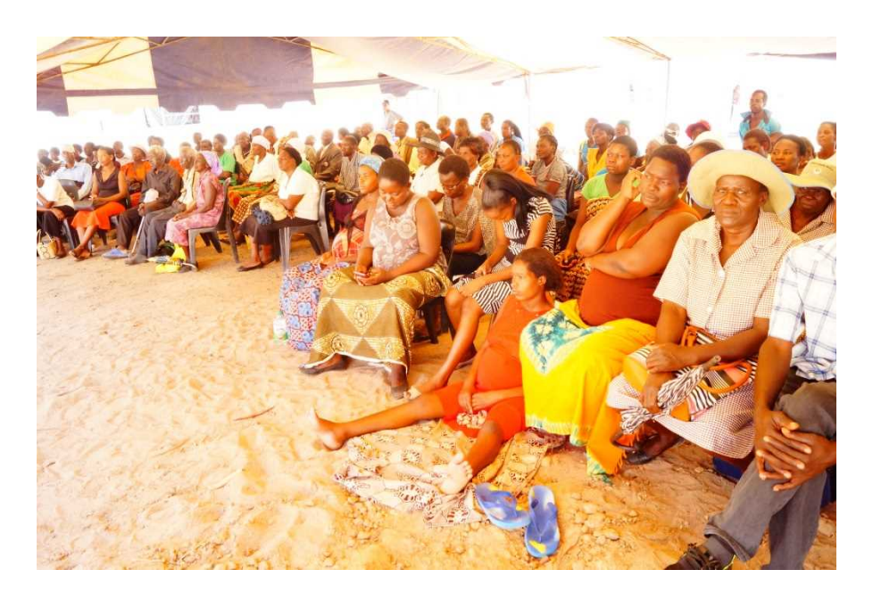
Community members gathered at the site (including the pregnant women)