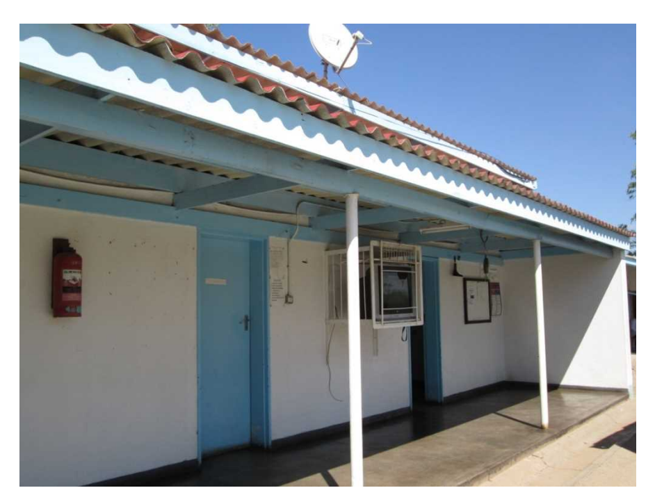
Renovated main ward