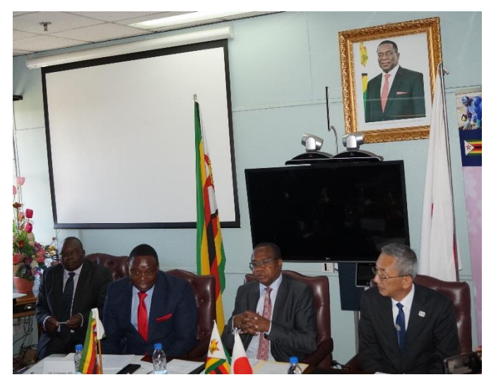
Hon. Minister Kazembe thanked Japan for its support.