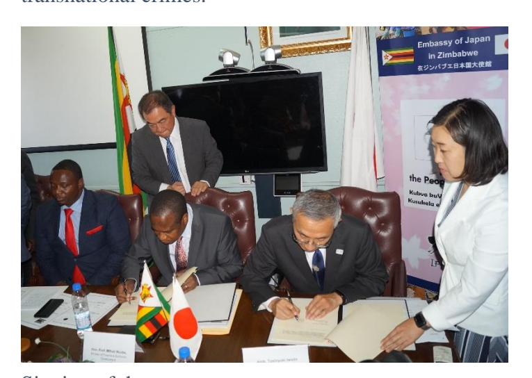
Signing of the agreement.