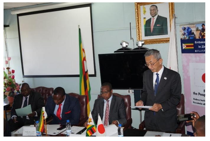
Ambassador Iwado hopes that the cybersecurity equipment will improve safety.