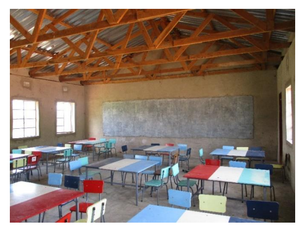
New desk and chairs