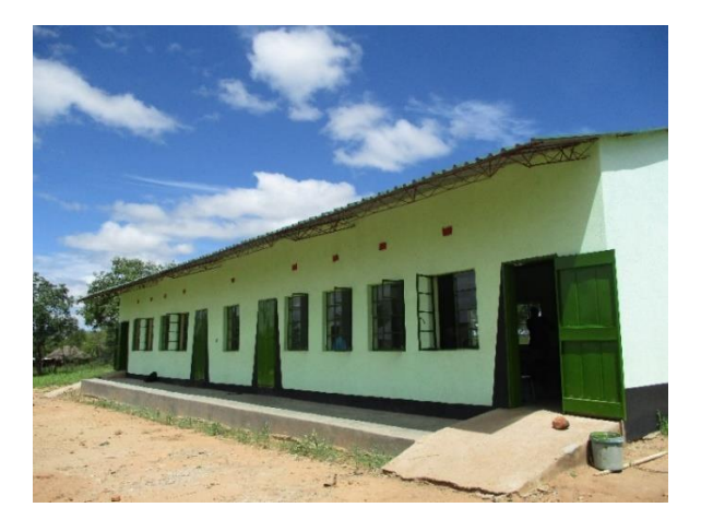
New classroom blocks