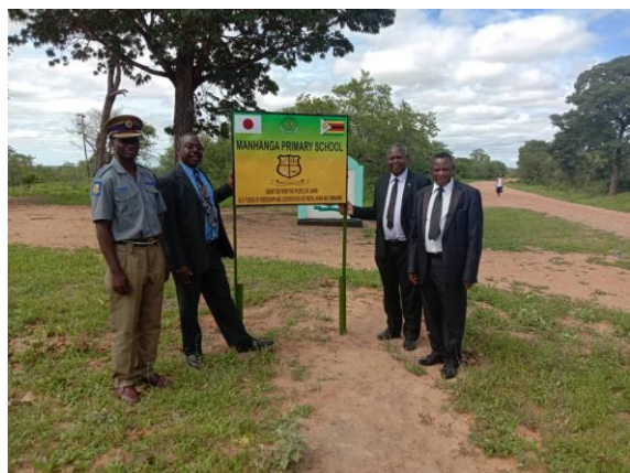
Sign plate showing support from Japan