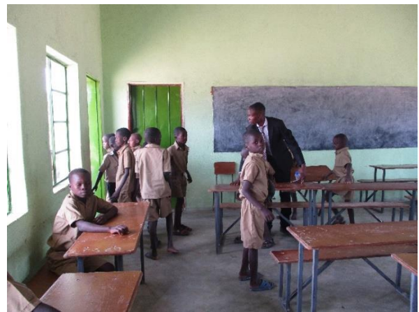
Students in a new classroom