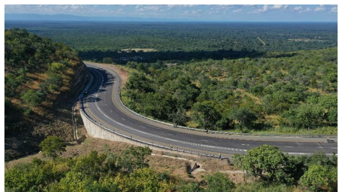
Completed Phase 1 Section