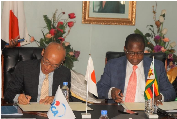
Signing of Exchange of Notes documents