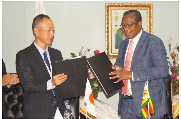
Exchange of Grant Agreements