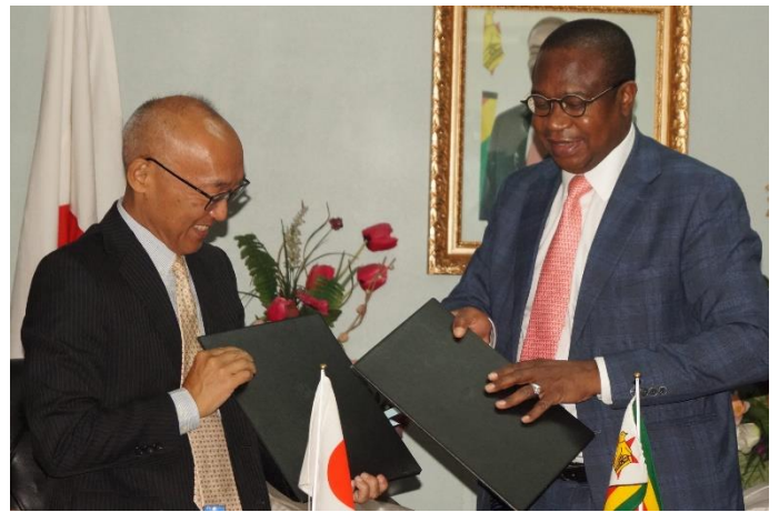
Exchange of Notes