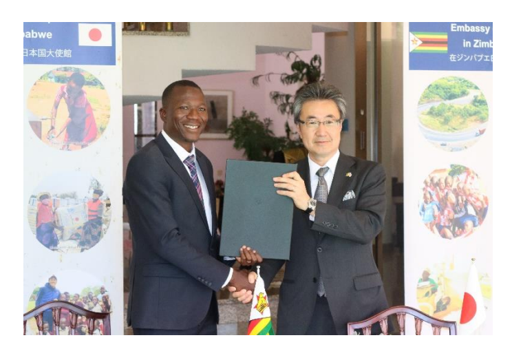
Exchange of Grant Agreements