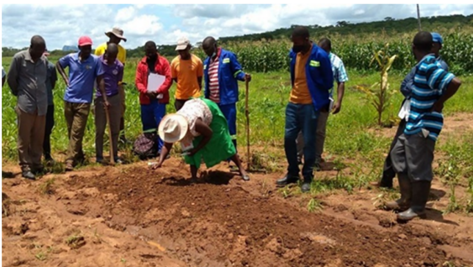
▲ Training for seeding at Chitora Irrigation Scheme, Mutoko District, Mashonaland East Province