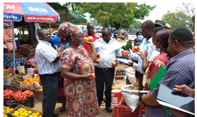
▲ Training for market survey in Karoi Town by Magunje Irrigation Scheme farmers, Hurungwe District, Mashonaland West Province