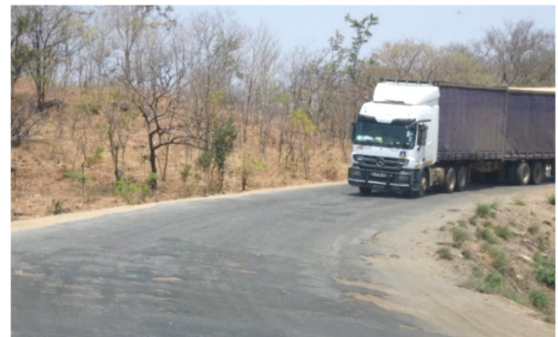
▲ Before (between Makuti and Marongora)

Improvement of a further 7.8 km section between Makuti and Marongora, including widening of curves and improvement of the vertical and horizontal alignment. 2022-2026, USD 17.8 million, Grant Aid