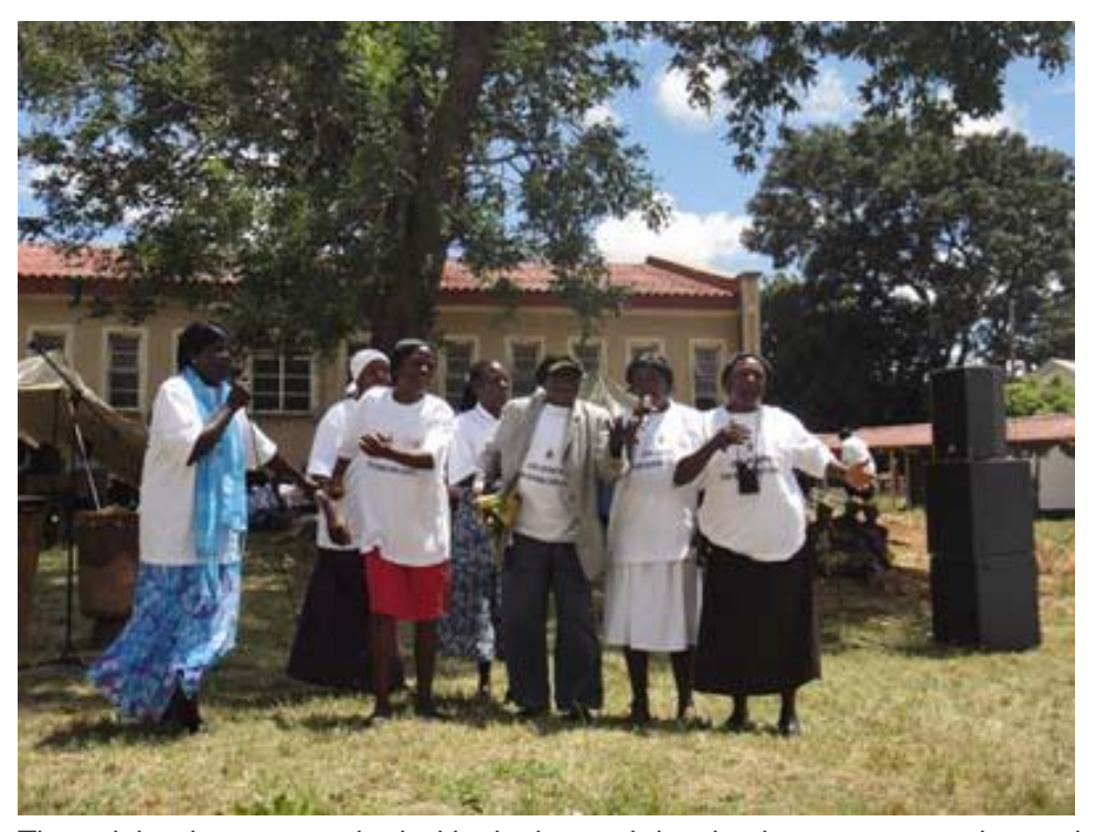
The celebration was marked with singing and dancing by pregnant and parturient women